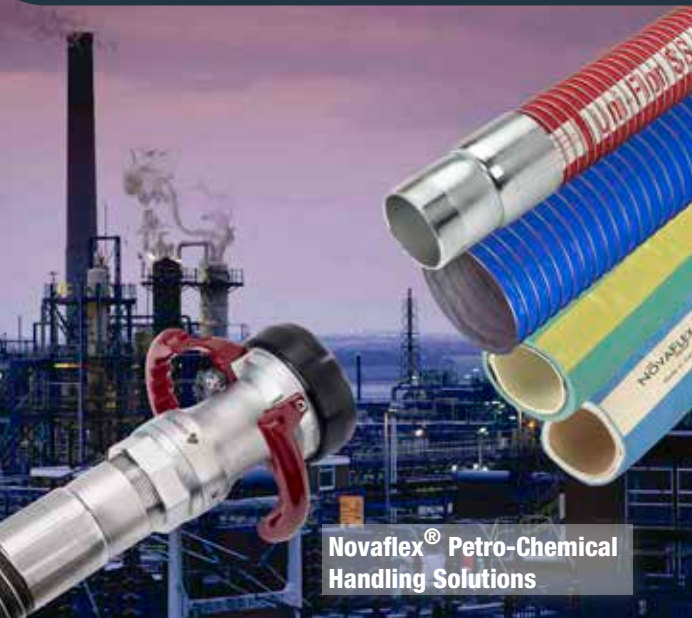
Novaflex® Petro-Chemical Handling Solutions

Novaflex® offers the most comprehensive petrochemical, liquid, vapor & fume transfer solutions, chemical fume extraction duct, petrochemical transfer hose systems, HDC® dry disconnect couplings