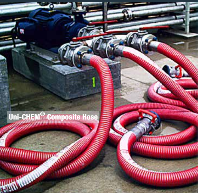
Uni-CHEM® Composite Hose

Novaflex® offers the most comprehensive petrochemical, liquid, vapor & fume transfer solutions, chemical fume extraction duct, petrochemical transfer hose systems, HDC® dry disconnect couplings